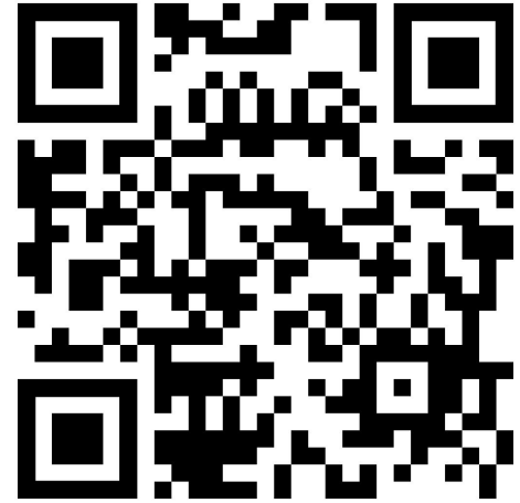
Trip Shirt Size Form